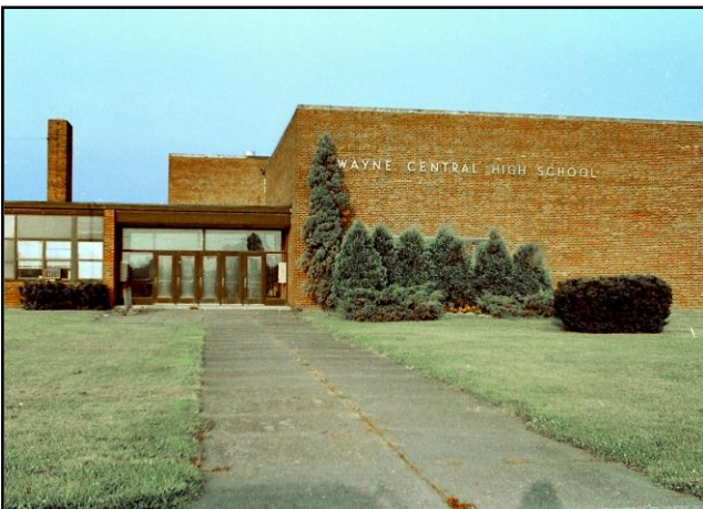
Wayne Central High School circa the mid 1950's

On April 29, 1949, the New York State Commissioner of Education issued the order for the centralization of 21 common and union free school districts within the towns of Ontario, Walworth, Macedon, Williamson, Webster and Penfield. The newly formed district consisted of about 72 square miles and served just over 1,000 students. In 1972, six square miles were ceded to the newly formed Gananda Central School District.