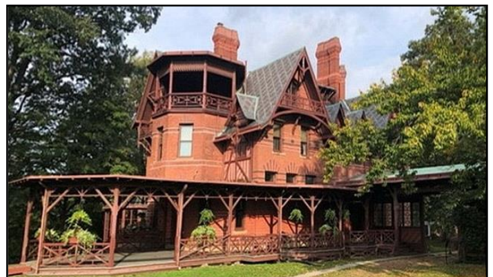
Mark Twain house & museum, CT

WHS website: walworthhistoricalsociety.org