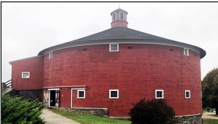
Shelburne Vermont Museum (round barn style)

So, what to do with all those pictures? We like to share, so we created a slide show for the Senior Citizens group that meets each Wednesday at the Lutheran Church in Webster. As long as we had done all that work, we thought that maybe some people in Walworth might like to see it also. Although we didn't have a great turnout on December 10, those who came seemed to enjoy the tour.