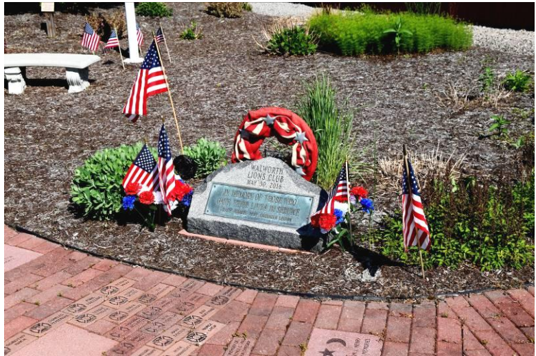
Above are photos from the Walworth Lions Club Memory Garden