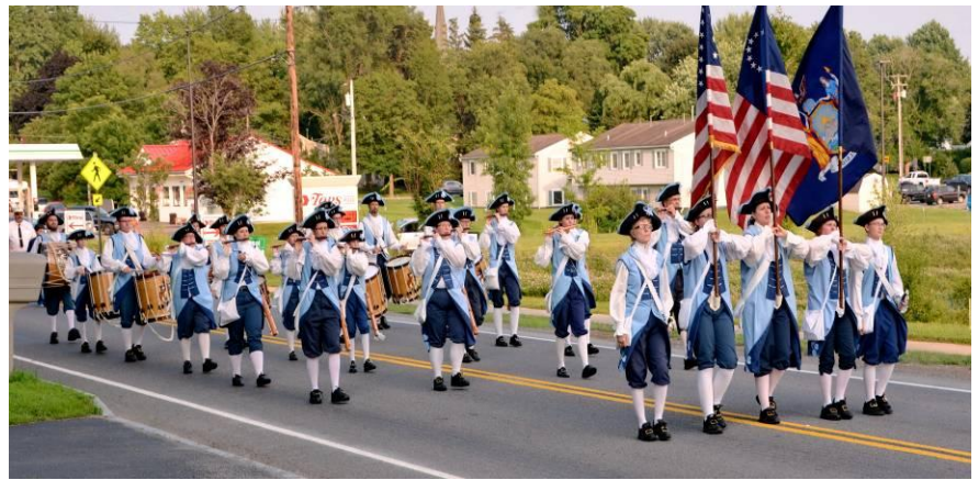
Above is a photo from the 2017 Festival in the Park Parade.

http://e-clubhouse.org/sites/walworthlionsclub/ .