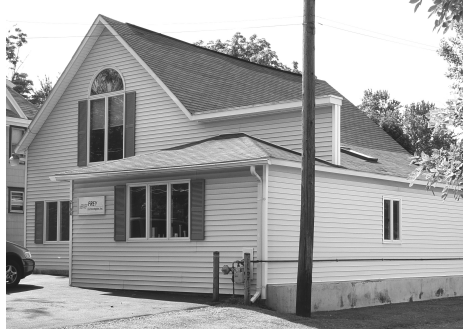
2194 Penfield Road