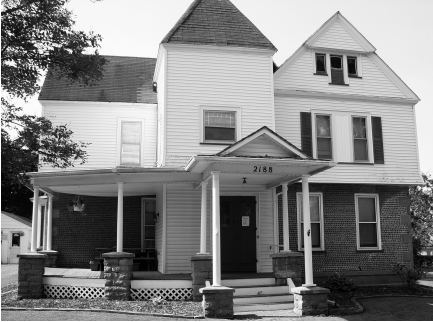
2188 Penfield Road

NOTE: House numbers throughout Wayne County were changed in the mid 1970's for simplification and emergency response purposes. The numbers in parentheses are the original numbers that are no longer used. The road was originally called Town Line Road or Rochester Road.