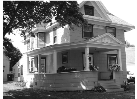
2200 Penfield Road