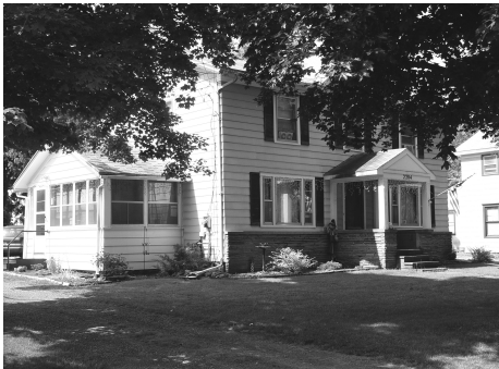
2204 Penfield Road