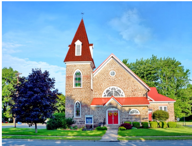
The Second Baptist Church of Walworth as it appears today