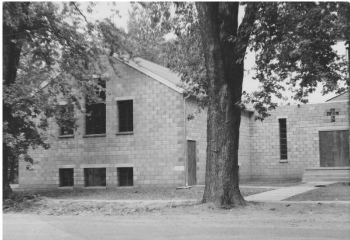
The church education wing 1954