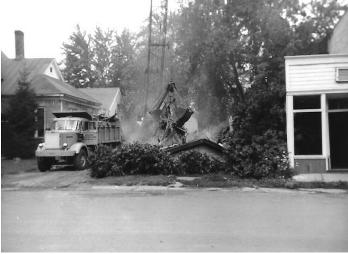
Truck ready to collect debris from the house.