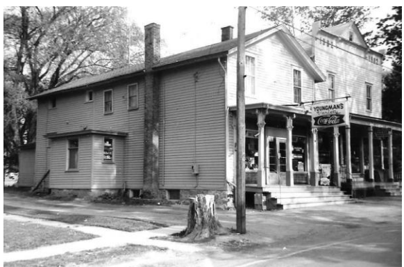
1965: Before the addition to the north and back of the store.

In 1950 Katie and I rented the variety store from Joe and Lorraine Finley and I moved my ice cream business from the "little store" across the road. In 1963 we purchased the building from the Finleys. By 1965 we had expanded the inventory to a point where we needed more retail space so an addition was added on the north side and back of the store to double the floor space. This made it possible not only to add to the original inventory but to offer new items. Doing business under Youngman's Variety Store we carried such items as all types of dry goods including clothing, footwear, sewing accessories, toys, jewelry, patent drugs and drug sundries, school supplies, greeting cards, records, and candy.