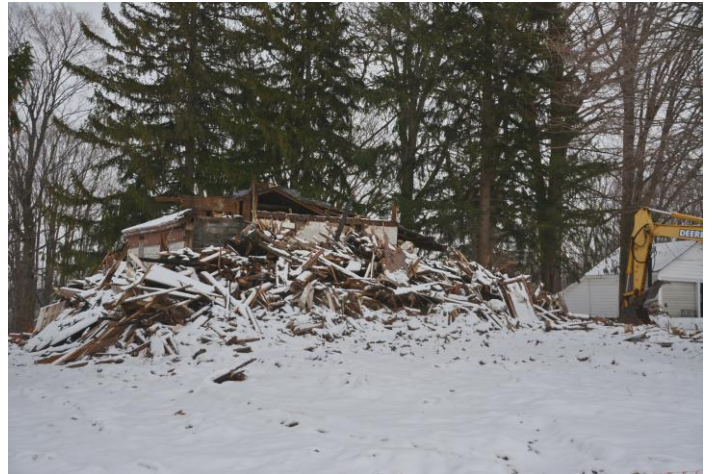
Demolition almost complete