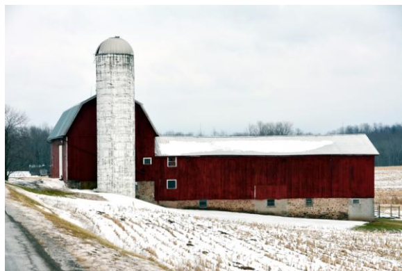
Recent photo of the hooked-rug barn.