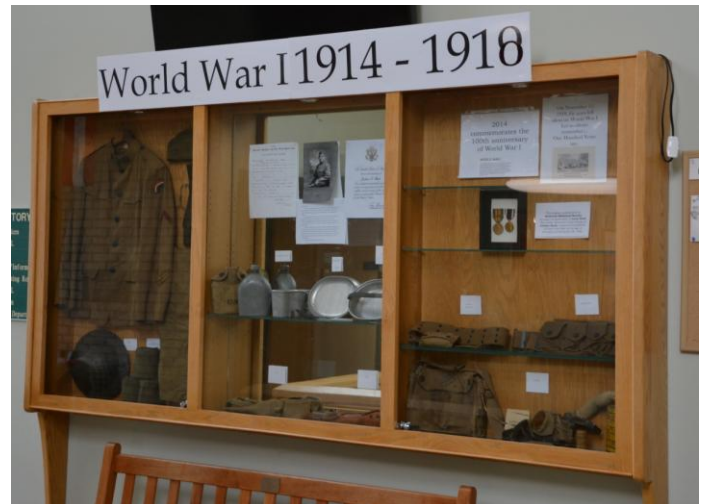
World War I display