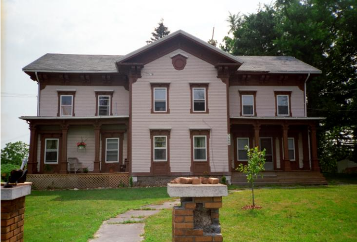
Before the fire

(All images on this page are of Evergreen Place)