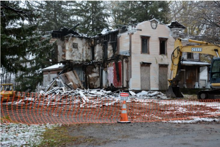
At the start of tear-down