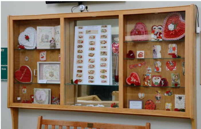
Valentine's Day display