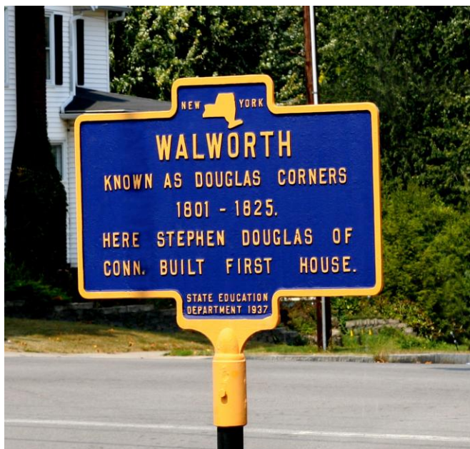
State marker at the Walworth four corners

Question: What do the years 1799, 1829, and 2019 have in common?