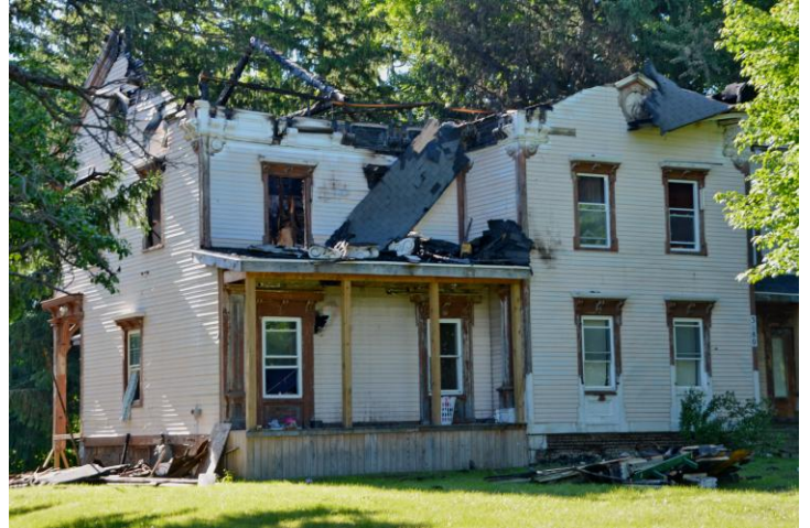
Just after the fire