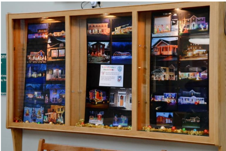
Holiday-decorated homes display

February's display focused on Valentines from the past, as well as "calling cards" which featured some amorous sentiments.