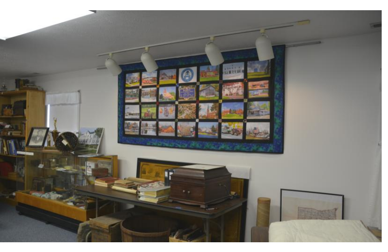
The new photo quilt at the WHS museum