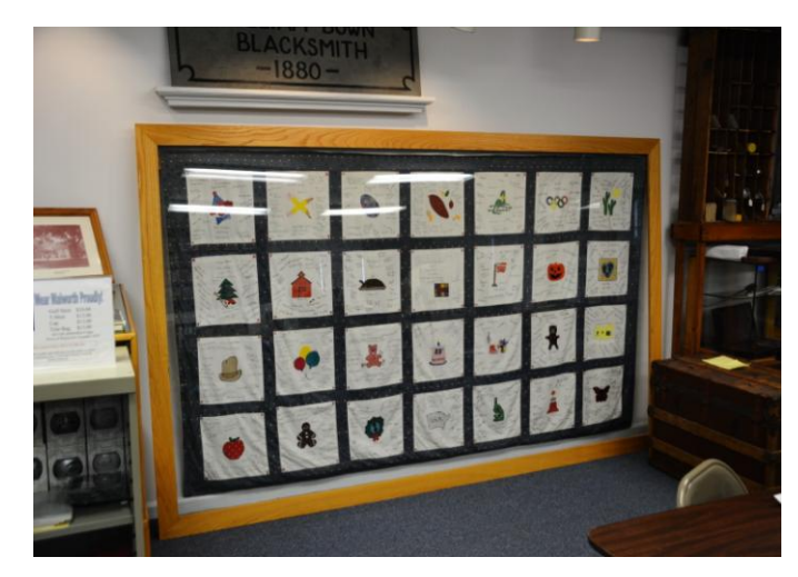
The Freewill School Quilt at the WHS museum