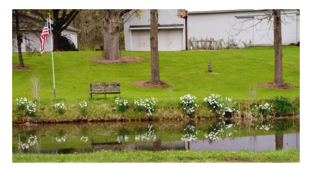
WHS July 2018 Newsletter (page 7)