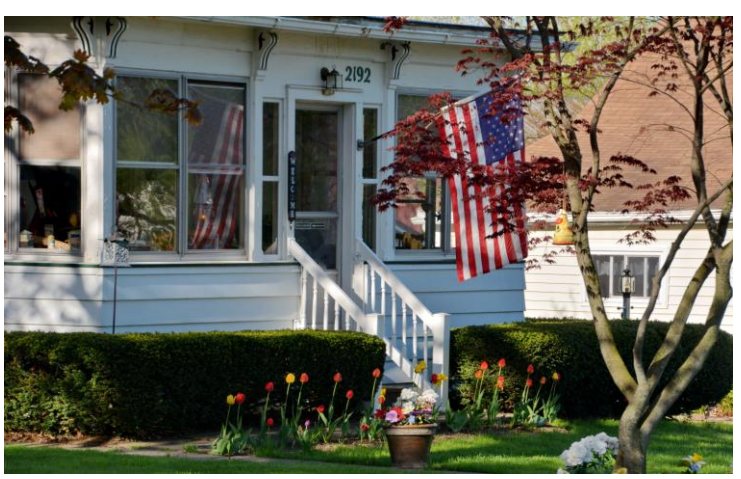
One of the local Walworth homes in spring