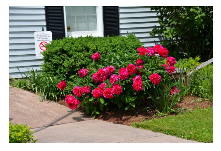
The President Grover Cleveland peonies