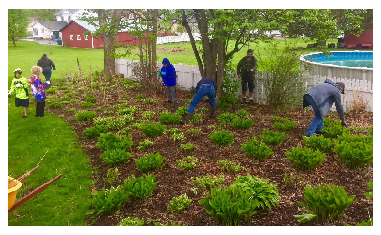
WHS July 2018 Newsletter (page 10)