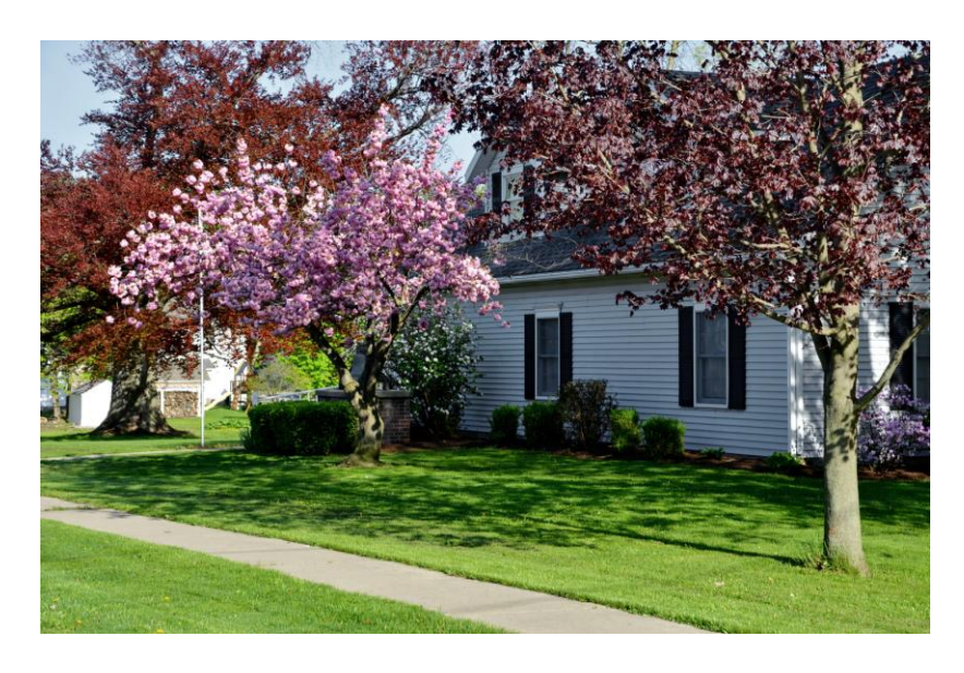
The WHS museum in spring bloom

WHS website: walworthhistoricalsociety.org WHS July 2018 Newsletter (page 9)