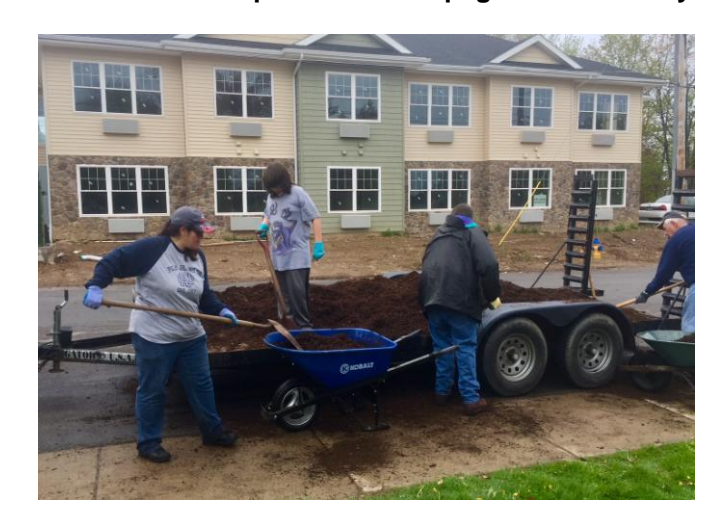
All photos on this page are of the Boy Scouts assisting at the WHS museum clean-up.